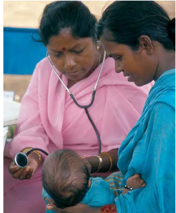
Visiting young patients at home, India, photo: GTZ/Richard Lord

The UN Committee on Economic, Social and Cultural Rights monitors the implementation of the ICESCR. In its General Comment No. 14 of 2000, the Committee has defined four core elements (see below) as the substance of the right to health.