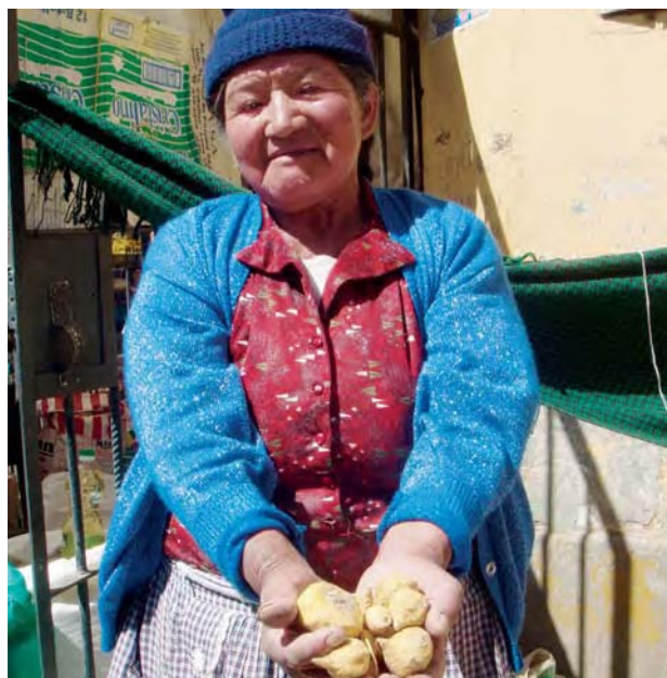
Woman in Peru offering Maca roots

The right to food adds a quality dimension to the process for achieving the Millennium Development Goal of eradicating extreme poverty and hunger (MDG1). Human rights principles – for example participation, non-discrimination and accountability – are particularly helpful since they direct the focus towards disadvantaged regions and groups and demand accountability from all players at the national and international levels. Overall, human rights-based policies for food security and agriculture enhance the impacts in other sectors, inter alia the impacts on sustainable economic development and protection of the environment and natural resources.