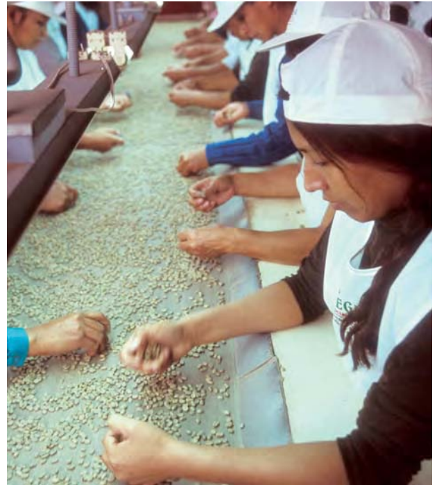
Sorting coffee beans in Peru

In their General Comments, the UN treaty bodies have specified the substance of specific human rights and the corresponding state obligations. The state is obliged to respect human rights. For example, the right to work stipulates that the state must not adopt laws that arbi-