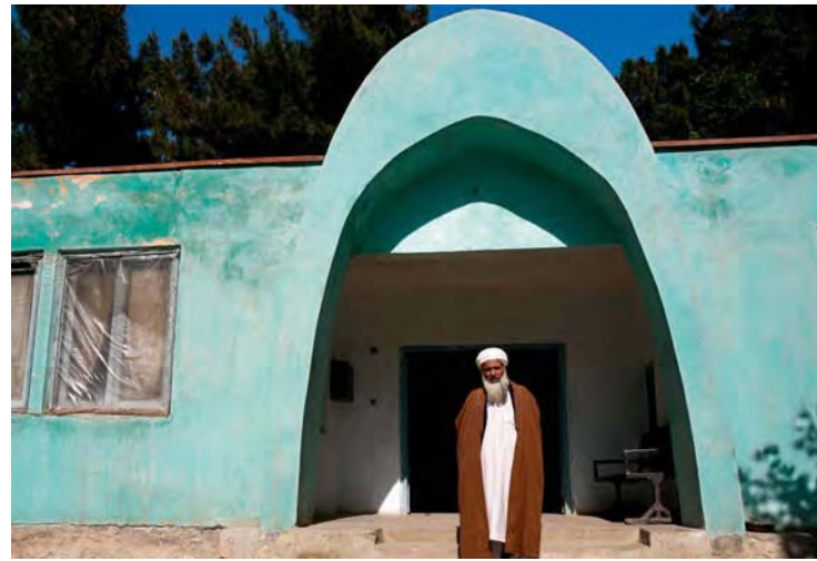
An Appeals Court in Afghanistan, photo: GTZ/Travis Beard

The human right to “be equal before the courts and tribunals ... and to a fair and public hearing by a competent, independent and impartial tribunal established by law” is enshrined in article 14 of the International Covenant on Civil and Political Rights (ICCPR). The UN Human Rights Committee monitors the implementation of the ICCPR and has defined four basic guarantees (see