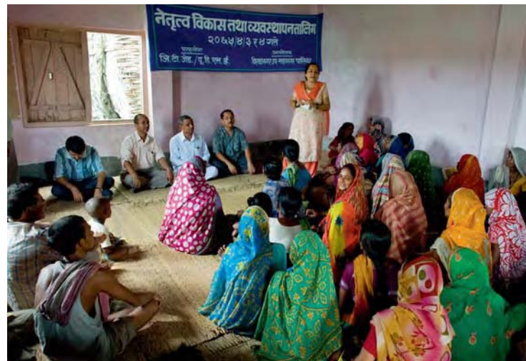
Citizens' debate in Nepal, photo: GTZ

The specific targets of individual human rights are detailed in the General Comments to the International Covenants on Civil and Political Rights and on Economic, Social and Cultural Rights. Defined by the UN expert committees that monitor treaty implementation, the General Comments offer concrete ideas for shaping national and local policy in individual sectors.