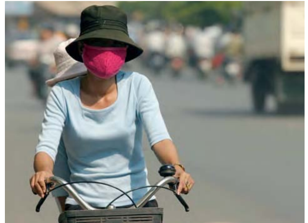
Cycling in Cambodia, photo: GTZ/Richard Lord

The most relevant human rights for this sector are contained in the International Covenant on Civil and Political Rights (ICCPR) and the International Covenant on Economic, Social and Cultural Rights (ICESCR). The UN Committees monitoring the implementation of the Covenants have interpreted the substance of the human rights guaranteed in the treaties, inter alia through their so-called General Comments. These Comments spell out that a clean environment is indispensable for the realisation of many human rights, in particular the rights to health, food and water. In addition, they interpret access to, and use of, vital natural resources as an important aspect of the socio-cultural identity of indigenous minorities, and worthy of protection. The development of a separate human right to a clean environment is under discussion. The human rights-based approach focuses on persons and groups that are particularly affected by environmental pollution and