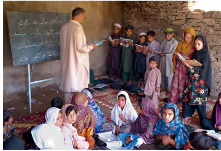
Learning, even under most difficult conditions, photo: GTZ/Florian Kopp

The human right to education is established in articles 13 and 14 of the International Covenant on Economic, Social and Cultural Rights (ICESCR). It is also found in