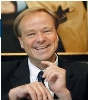
Minister Dirk Niebel

Respect, protection and fulfilment of human rights are the foundation for the democratic, economic and cultural development of every country. That is why human rights are a priority of Germany's government and an issue which cuts across all policy areas. The German government follows a value-based development policy in which human rights are a guiding principle. In the future, we will place even greater emphasis on this commitment!