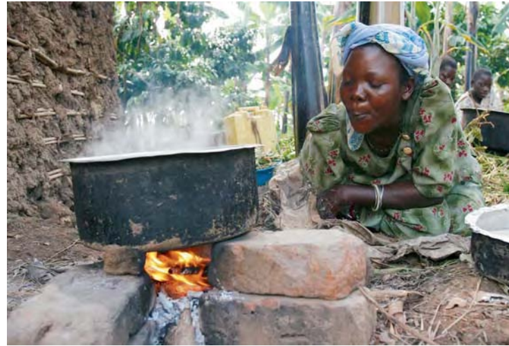
Cooking over an open fire in Uganda

Access to energy services is the prerequisite for the realisation of many other human rights: about 80 per cent of food is only edible if cooked; many forms of