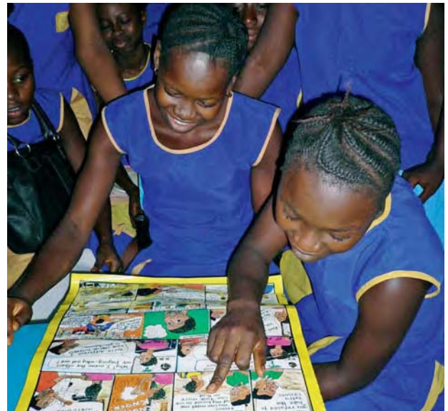
Raising awareness about corruption in a school in Sierra Leone, photo: GTZ/Dedo Geinitz

Even if the international human rights conventions do not explicitly refer to corruption, the United Nations treaty bodies, and in particular those responsible for the two international treaties governing civil and political rights (the ICCPR or "civil rights covenant"), on the one hand, and economic, social and cultural rights