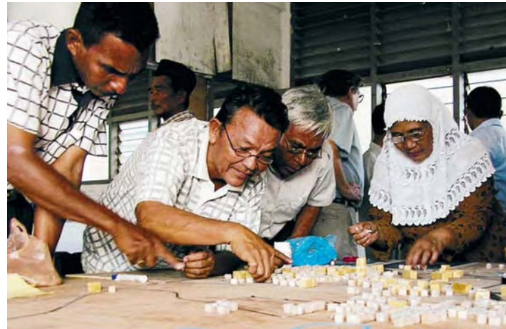
Citizens participate in planning

The HRBA leads to a paradigm shift: erstwhile “target groups” and “people in need” become holders of statutory entitlements, partner states’ institutions are now duty-bearers. Both groups are strengthened in their