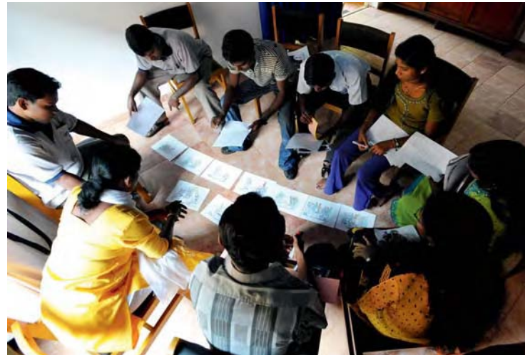
Understanding conflict: non-violent communication in Sri Lanka

Human rights oblige the state as duty-bearer to observe and uphold these rights, protect its citizens from human rights violations through third parties and ensure that all human rights are fulfilled. However, particularly in fragile or conflict-riven countries, states themselves may violate human rights, or may be unwilling or unable to prevent violent non-state actors from violating human rights. Such non-state actors are not directly bound by international human rights law. However, they are bound by parts of International Humanitarian Law; the universal prohibitions of war