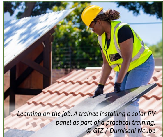
Learning on the job. A trainee installing a solar PV panel as part of a practical training.

The South African JETP places a strong emphasis on the private sector for the expansion of renewable energy. To succeed in this regard, South Africa has amended legislation and carried out necessary regulatory reforms. This has already led to a noticeable increase in private investments in renewable energy.