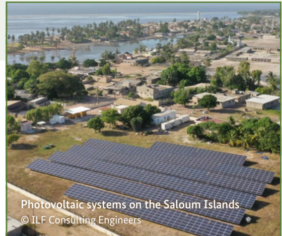
Photovoltaic systems on the Saloum Islands

The partnership was signed on 22nd June 2023 at the Summit for a New Global Financial Pact in Paris. Germany and France coordinate the G7 donors involved in the partnership, which also include the United Kingdom, Canada and the European Union. To advance the JETP quickly, Senegal has identified fast-track projects with its partners and already launched them at the World Climate Conference in 2023. Germany is financing two projects via KfW Development Bank which are aimed at improving access to electricity and enhancing the integration of renewable energy into Senegal's power grid.