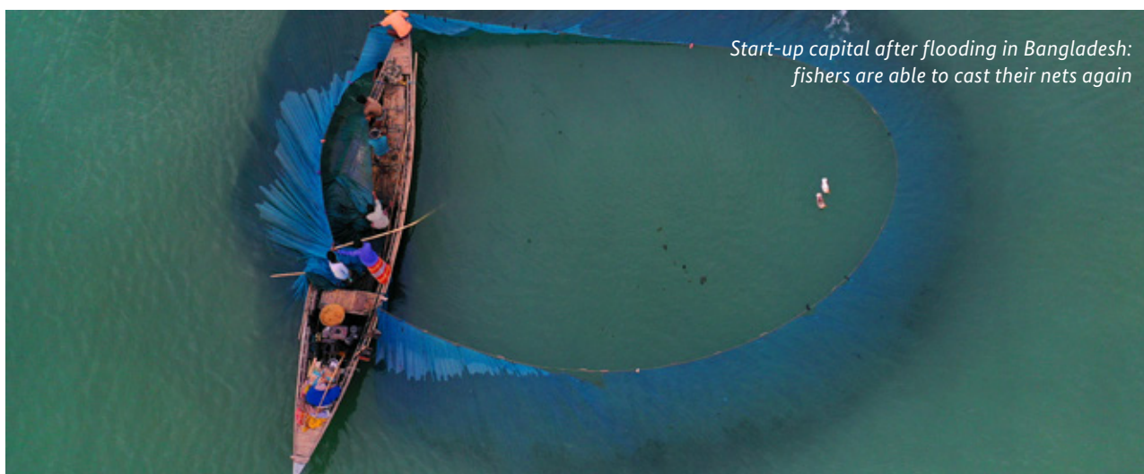
Start-up capital after flooding in Bangladesh: fishers are able to cast their nets again

Transformation capacity Disaster risk management measures tackle the root causes of vulnerability. Integrating these measures into projects on rural development, decentralisation, basic education, economic promotion or climate change adaptation contributes to a communities or peoples longer-term transformation capacity . For instance, providing improved seed has proved to be an extremely cost-effective measure with substantial potential to strengthen the resilience of vulnerable population groups in rural regions . Ecosystem-based approaches such as reforestation measures are