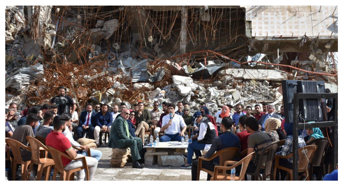
Photo: Discussion with citizens and Iraqi leaders live from destroyed Mosul in June 2018