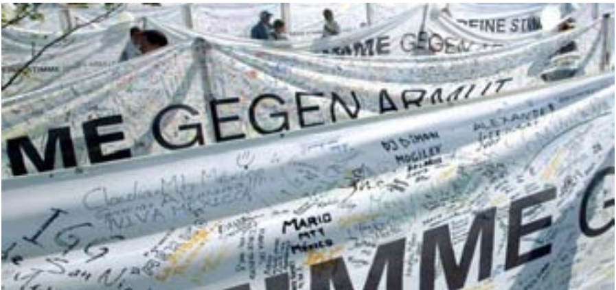
The "Your Voice Against Poverty" campaign in front of the parliament building in Berlin

The BMZ gives these NGOs financial support for their development activities, provided those activities are in line with the basic principles governing German development policy. The government exercises no influence over the NGOs' aims or policies. These organisations' independent status enables them to operate in countries and regions where there is limited scope for official development co-operation.