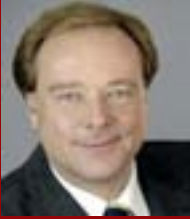
Minister Dirk Niebel

“Development cooperation is about giving people the freedom to shape their own lives and to build a bright future for their children by making their own decisions and taking responsibility for them, without suffering material hardship.