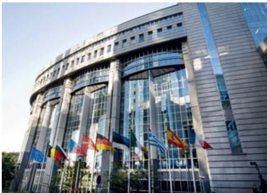
European Parliament, Brussels

The EU shares responsibility in the development field with its member states and complements their policies.