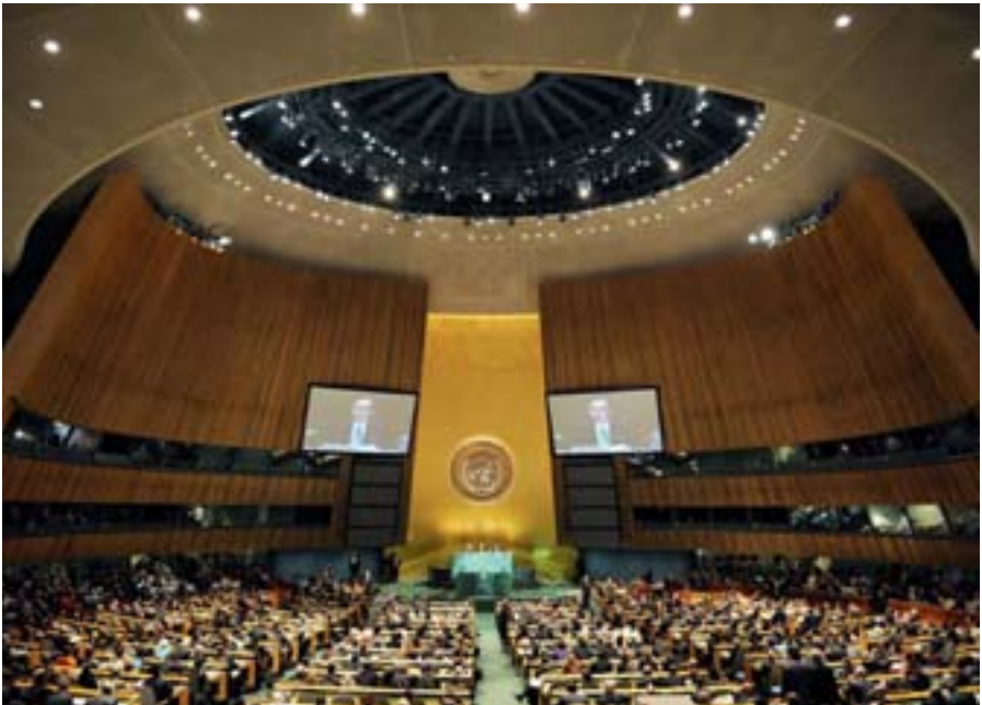
General Assembly Hall of the United Nations, New York

International organisations and the European Union are funded by their member countries. Through Germany's membership of such organisations as the United Nations, the World Bank Group, the International Monetary Fund (IMF) and the regional development banks, the BMZ is able to influence their policies. One focus of the BMZ's work is to improve the effectiveness and efficiency of international organisations.