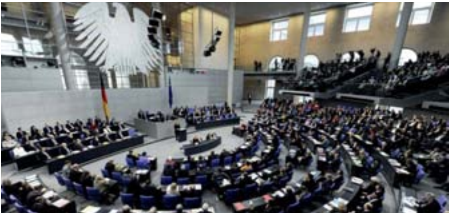
The debating chamber of the Bundestag, Berlin

The Development Ministry plays an active role in international negotiations and sends members of staff to work in international organisations and in partner countries. Within Germany, the BMZ supports the general public, non-governmental organisations, churches, foundations and businesses in their efforts in the development field. The Ministry's work is scrutinised by the Bundestag, the Lower House of the German parliament. The Bundestag Committee on Economic Cooperation and Development has special responsibility for this particular area of policy.