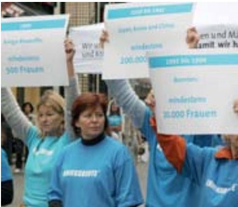
Demonstration by medica mondiale, Germany | Supervisor of a team of tea pickers, Kenya

6. Improving visibility. To be successful, development policy needs public support. Through our efforts to educate and inform the public about development policy, we create greater general awareness and acceptance of the aims and issues concerned.