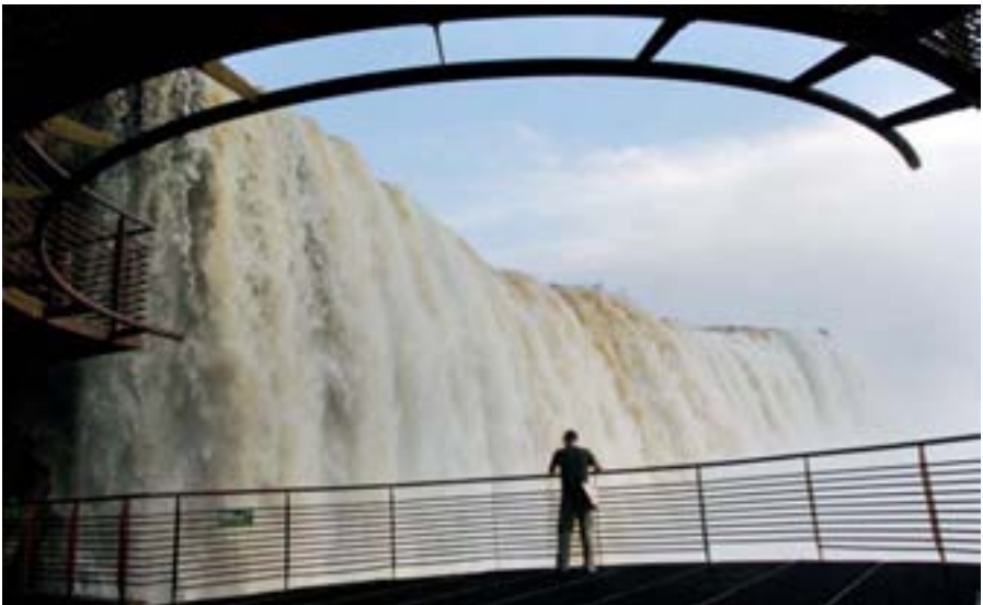
Energy from water, Brazil

And, not least, development policy helps preserve world peace and stability. So development policy is informed by both our values and our interests.