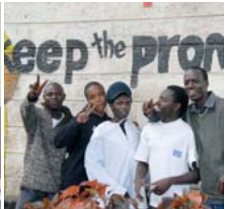
Early childhood health care and AIDS education for young people in Kenya