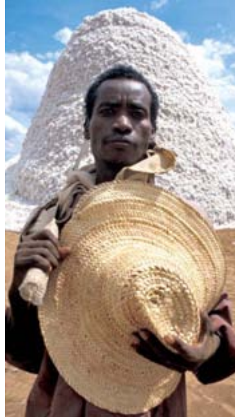
Cotton picker in Ethiopia

German development policy is informed by basic principles of human dignity and prosperity. It pursues freedom, human rights and solidarity within and between societies. Other countries demonstrated that kind of solidarity towards Germany following World War II. The Marshall Plan drawn up by the USA for West Germany laid the foundations for the prosperity we enjoy today.