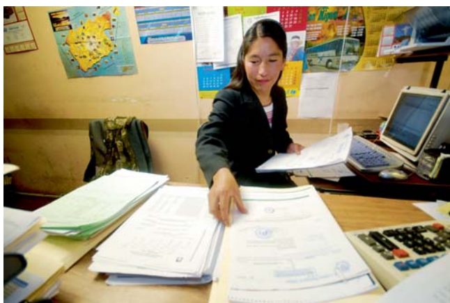
Public Administration, Bolivia

Promoting political involvement strengthens the legitimacy of state institutions and the democratic accountability of political players, makes the actions of government and public administration more transparent, strengthens checks and balances and allows effective action to be taken against corruption, arbitrary state rule and abuse of power.