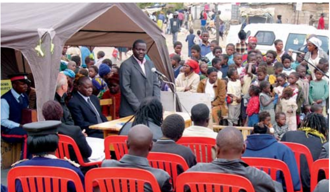
Speech at a Legal Aid Clinic in Kabwe, Zambia