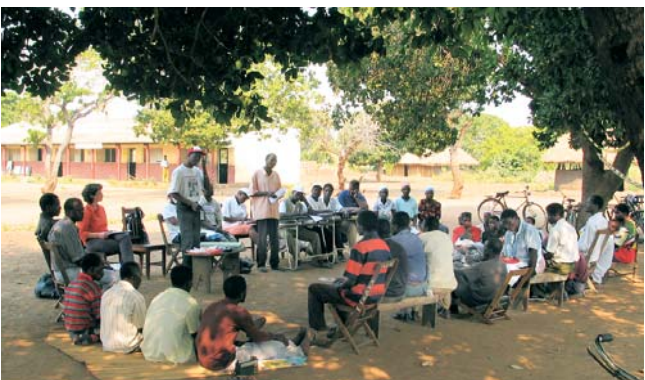
Citizen Assembly, Mozambique

The Federal Ministry for Economic Cooperation and Development (BMZ) is responsible for formulating the guiding principles and strategies of German development policy. It determines the long-term strategies for cooperation with the various actors concerned and regulates implementation. It commissions a variety of German implementing organisations to realise the government's development goals within the framework of official bilateral development cooperation. The BMZ's task is then to coordinate the various actors and instruments. This is vital to the success of the pluralistic system of German